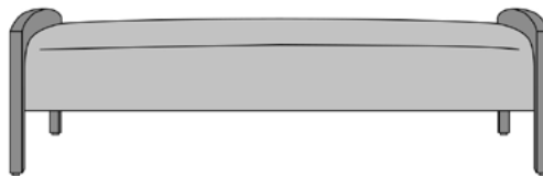
66A6 66W 20.5D 20H