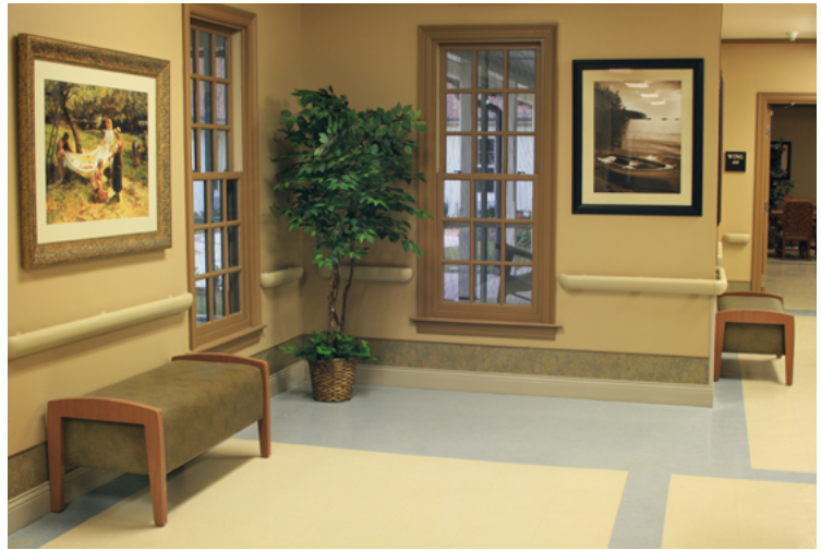
Model: 66A4 44W 20.5D 20H 41SW 20.5SD 19SH

Comfort and beauty define the Campania collection. Classic, yet dramatic, these benches, available in two sizes, are compact and space saving. They feature fine lines and stately proportions, available in a wide array of wood-grained finishes and are fully customizable to suit specific community needs.